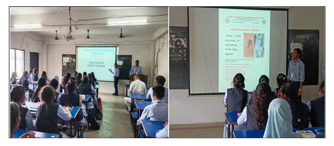
BCDE Soldiers conducted awareness campaign in nearby area.